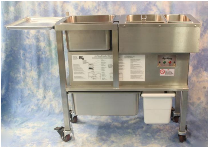
Shown but not included are 1/2 size bun pan & 1/3 size pan

AyrKing offers a breadng workstation and automatic Blender/Sifter machine with removable ice bath prep area. Rotary brush sifter operates without detrimental vibration or agitation. Spirally configured nylon bristles form an auger to eject unwanted dough balls to waste container. Ingredients are fully blended as brush tumbles breadng media before it exits through sifter screen. Unique process prevents dough ball grinding, eliminates usual sifting noise, & blends ingredients as it ejects waste.