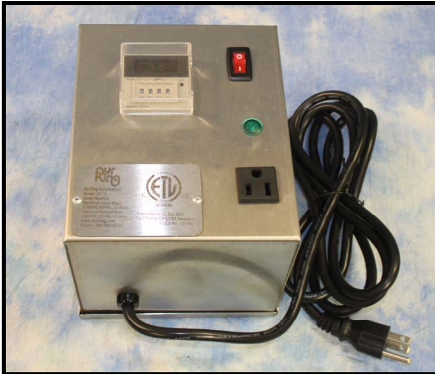
Photo of LS-TB

AyrKing offers a remote timer box, model LS-TB, to be used with the AyrKing syrup stirrer. The timer box is remotely mounted to a wall and plugged into a standard 120 Volt AC receptacle. The syrup stirrer is then plugged into the electrical outlet on the front of the timer box. The desired run time can be set on the timer mounted in the face of the timer box. The left two numbers set minutes and the right two numbers indicate seconds. Normally the timer is set to run for 60 minutes. The mixer can then be turned on with the switch on the timer box. The green led light and illuminated timer display indicate when the stirrer is operating. The unit shuts off automatically.